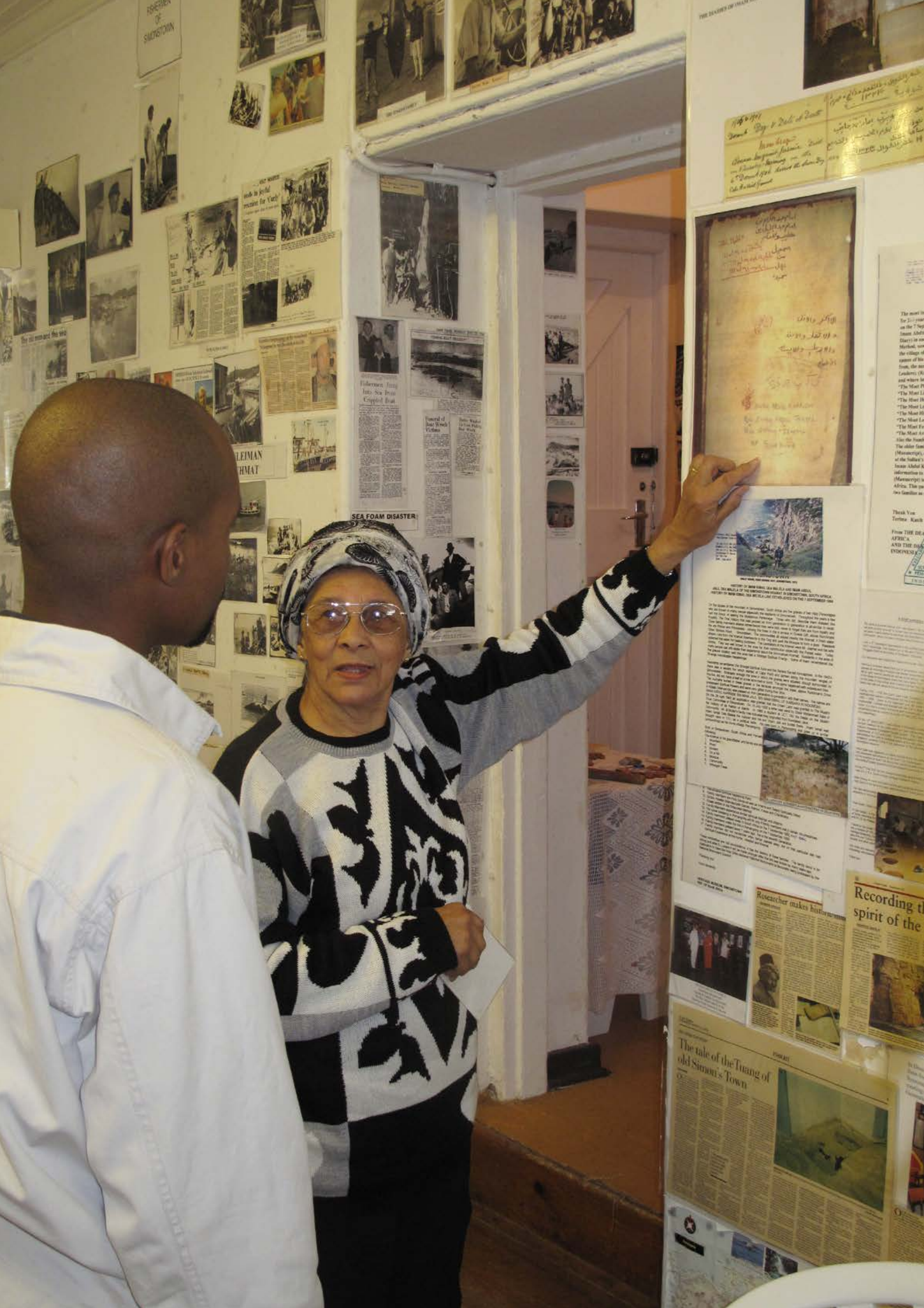
FREEDOM OF SUDAN